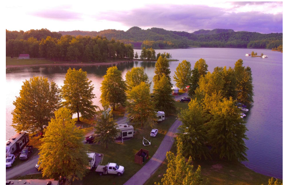
RV Park Branson, MO