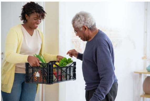
Turn Key Home Health Care