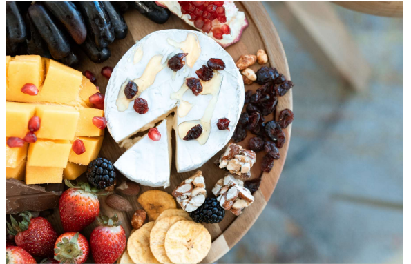
Restaurant & Catering Business