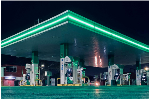
Northwest Arkansas Convenience Store