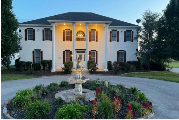
Mansion at the Orchard