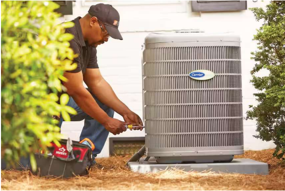
Regional HVAC Company