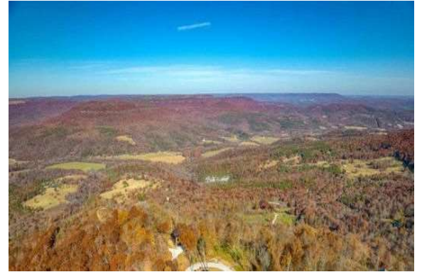
Slice of Paradise in Newton Co.