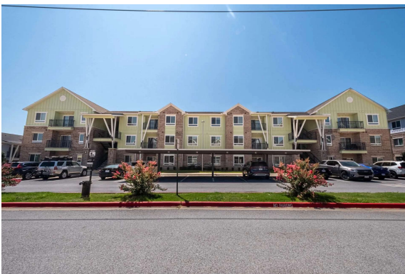
Watercolors Apartments & Condos