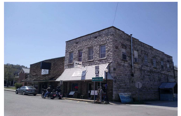
Blue Mountain Bakery & Cafe