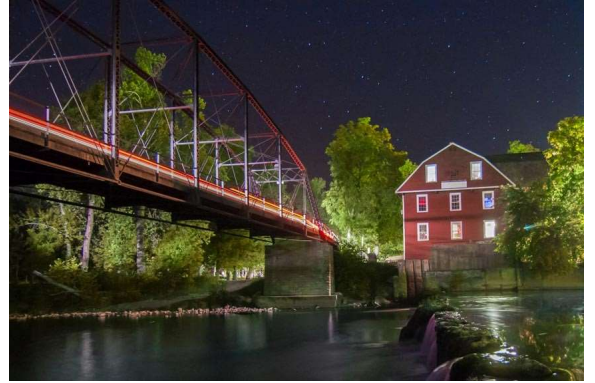
War Eagle Mill