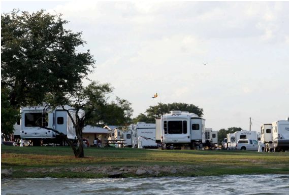
RV Park Newton County, AR