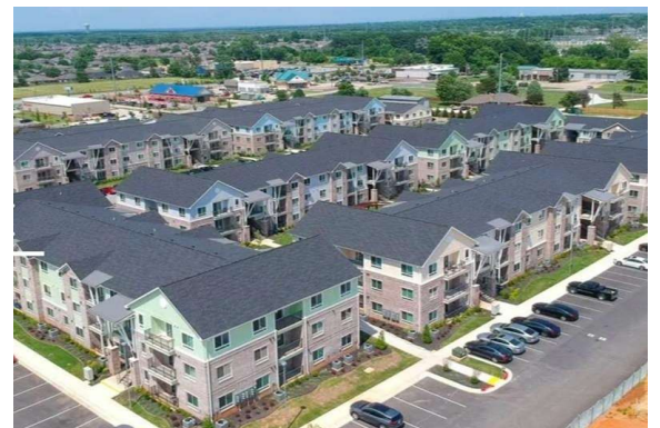
Centerton Community Apartments